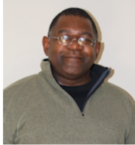
My Mother's Journey