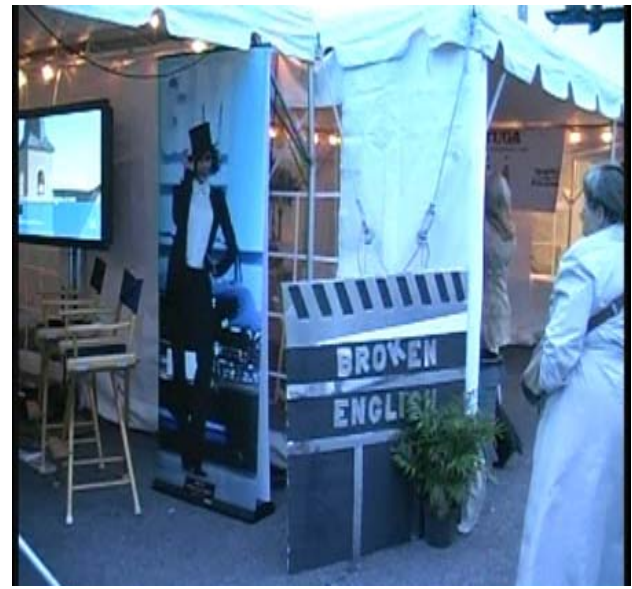
RECEPTION MARYLAND FILM FESTIVAL ZOE CASSAVETTES FILM, "BROKEN ENGLISH"